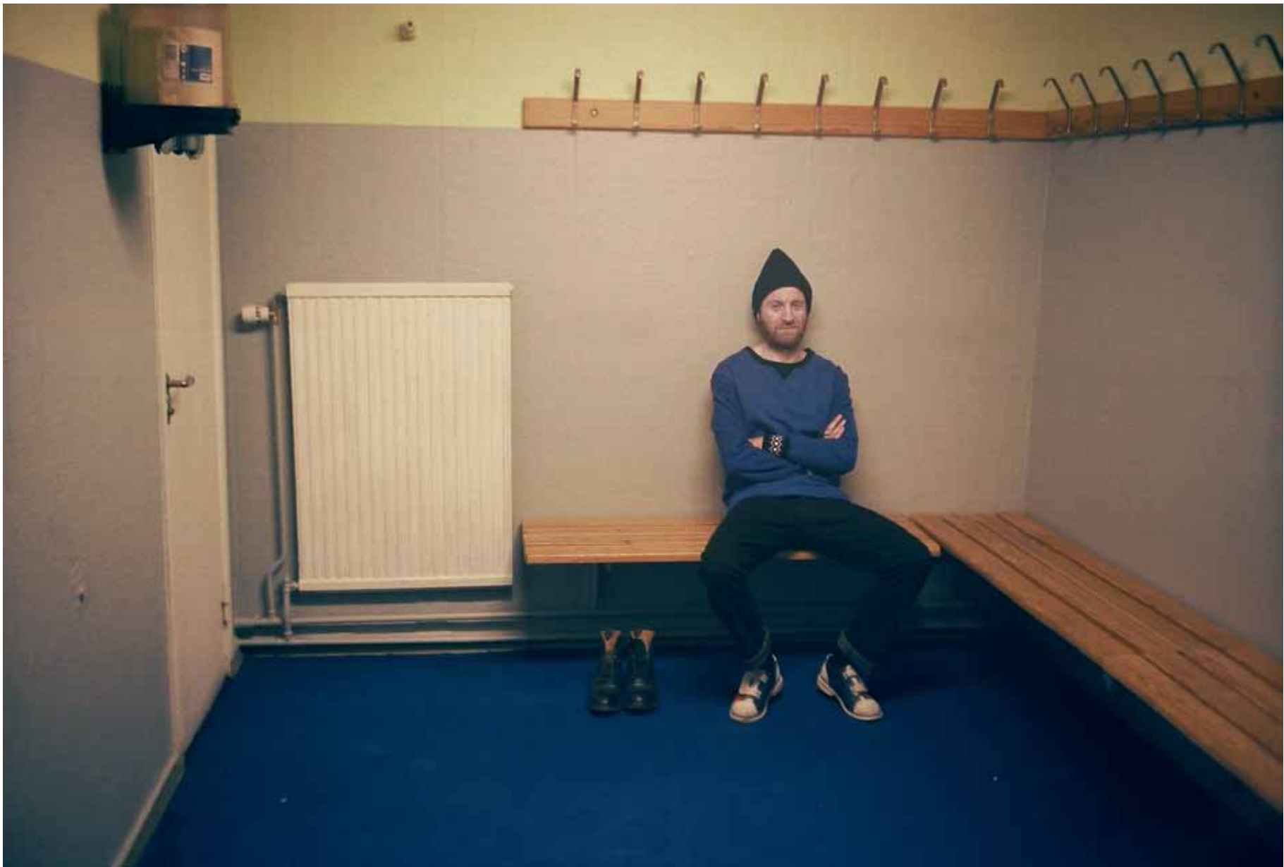
blue sweatshirt with black details MR&MRS FURBlack wool cap LE COQ SPORTIF