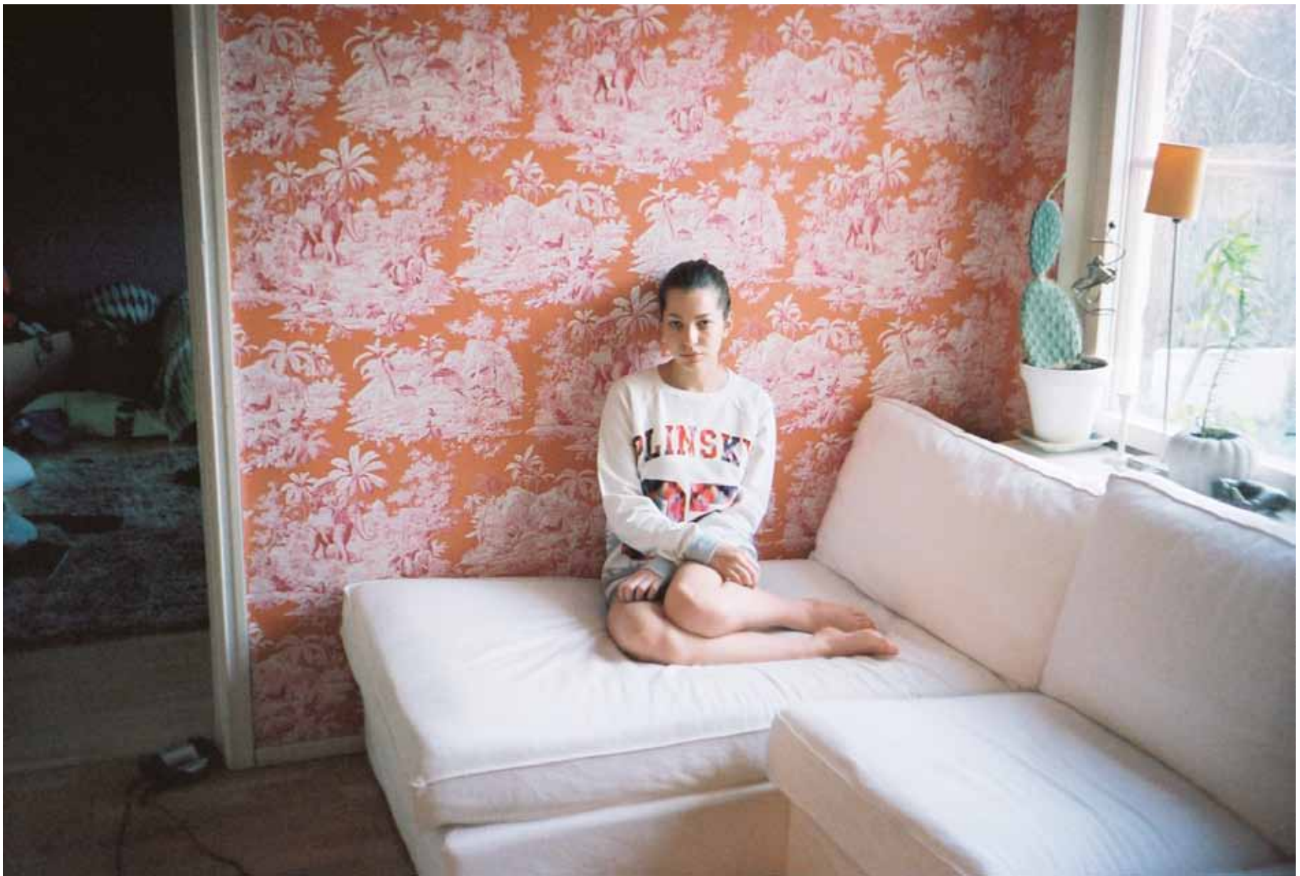
white cotton sweatshirt with boat neck and palm print logo on front PLINSKY