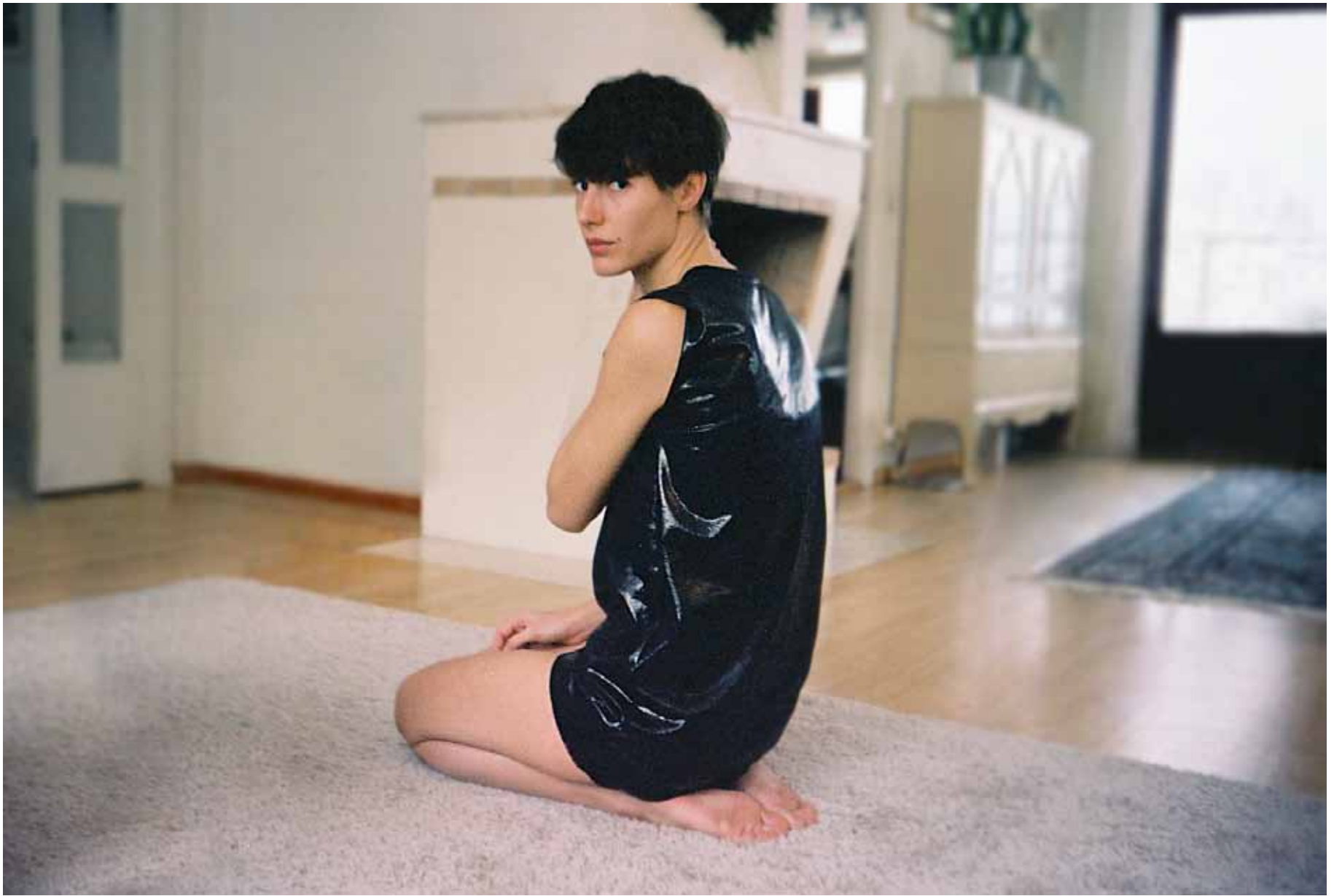
black shiny sleeveless top ARTHUR ARBESSER