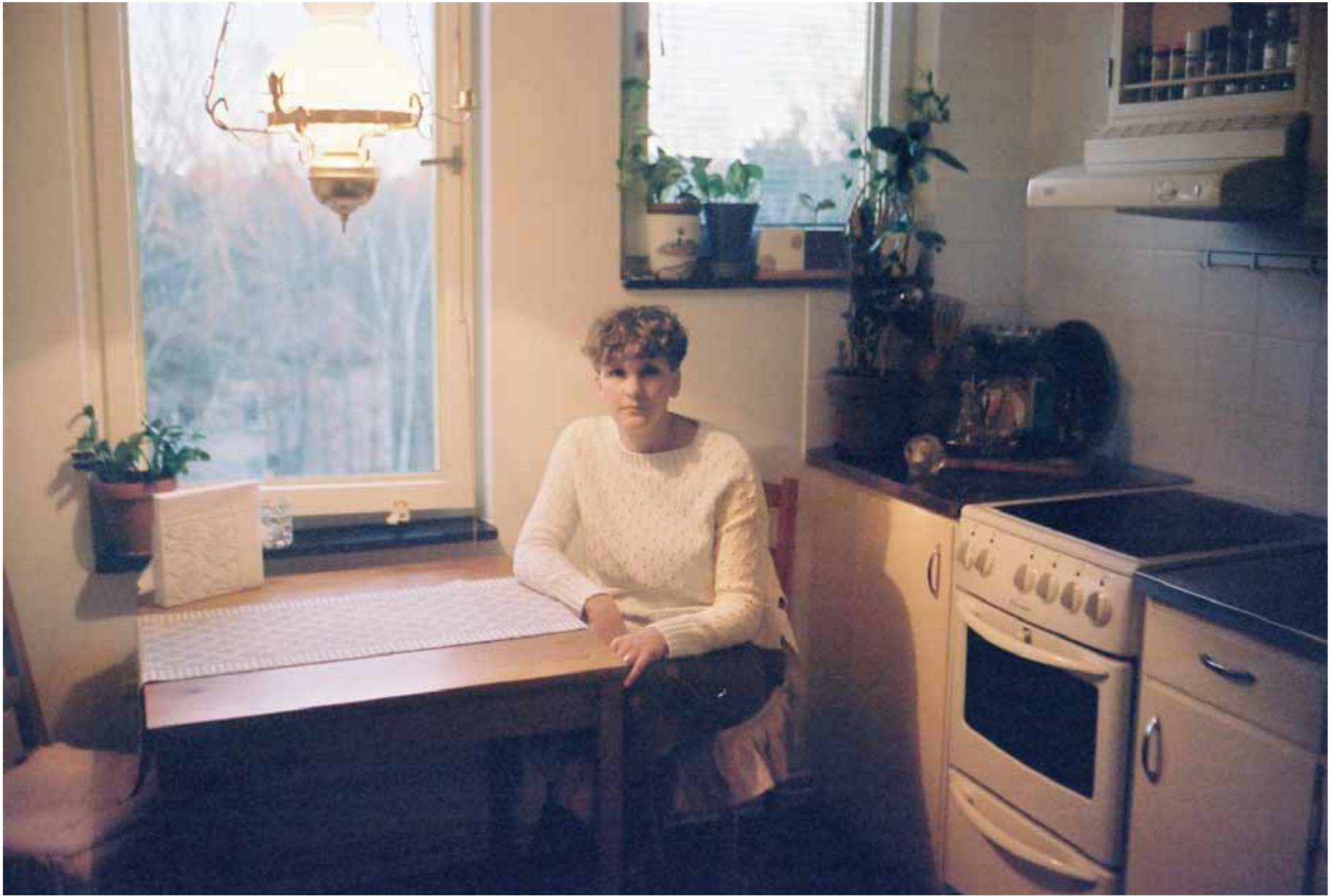
white sweater GAP