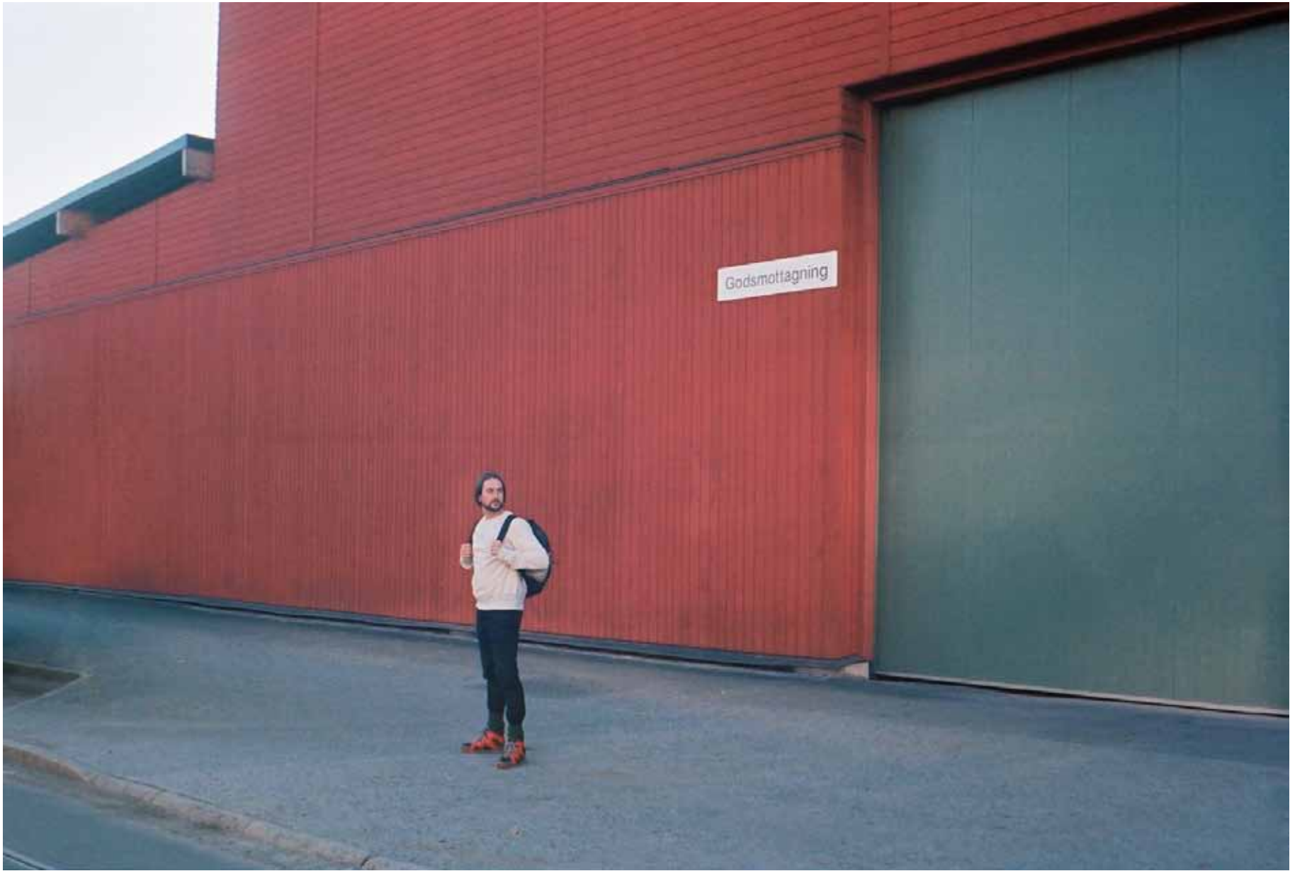
cream cotton sweatshirt CHAMPION