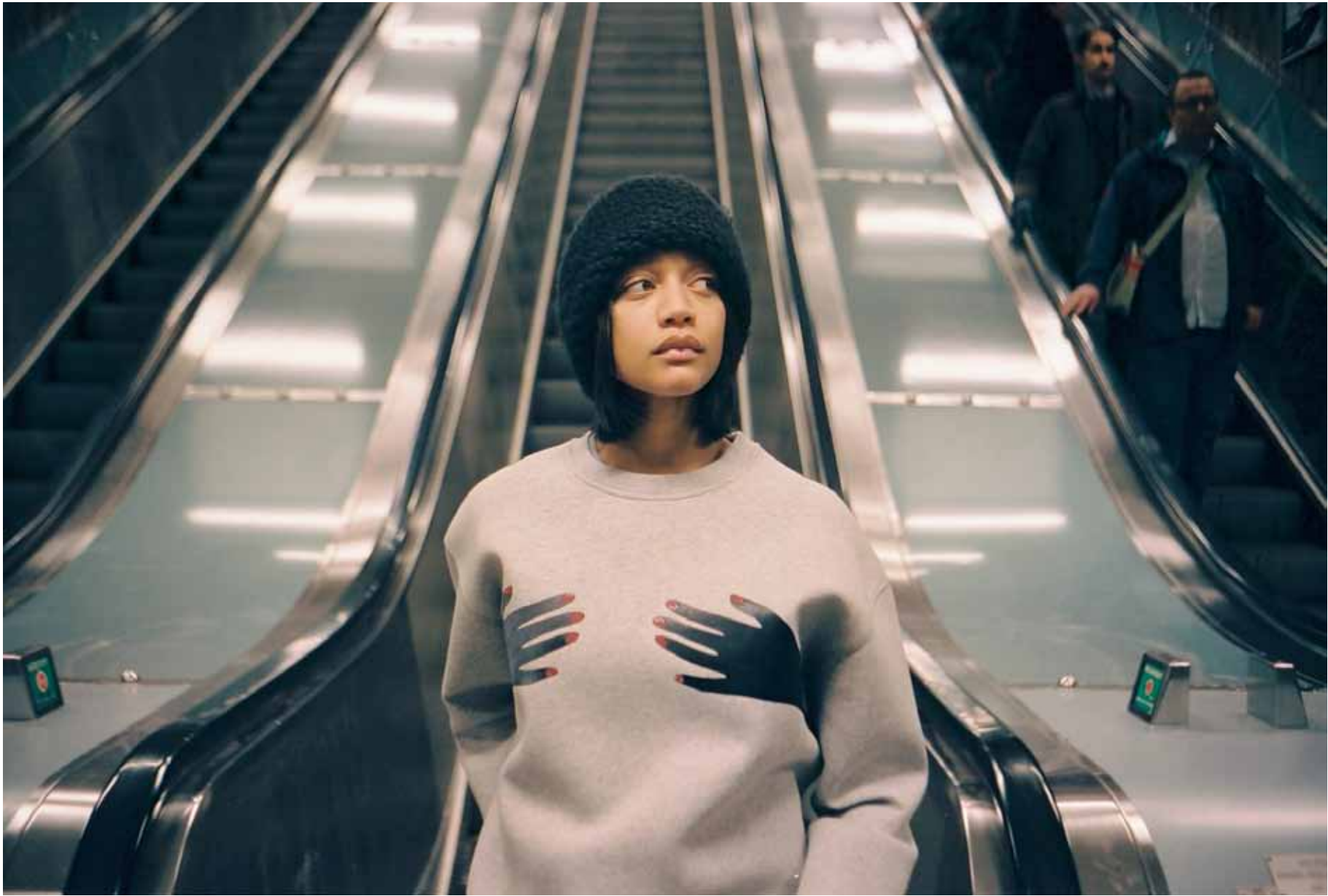
gray sweatshirt with hands print YOOX by GENTUCCA BINI black wool cap LE COQ SPORTIF